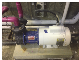
Above—Acid Transfer-Mixing-Pumping System (JeffPro) Left-Turn-Key Fire-Foam Pumping System (Patterson)