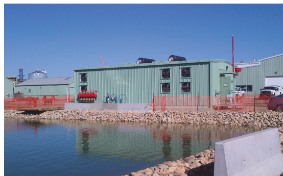
Above—Turn-Key Fire-Foam Pump System (Patterson) Left—Portable Axial Flow Dewatering Pump Package (FPI Pumps)